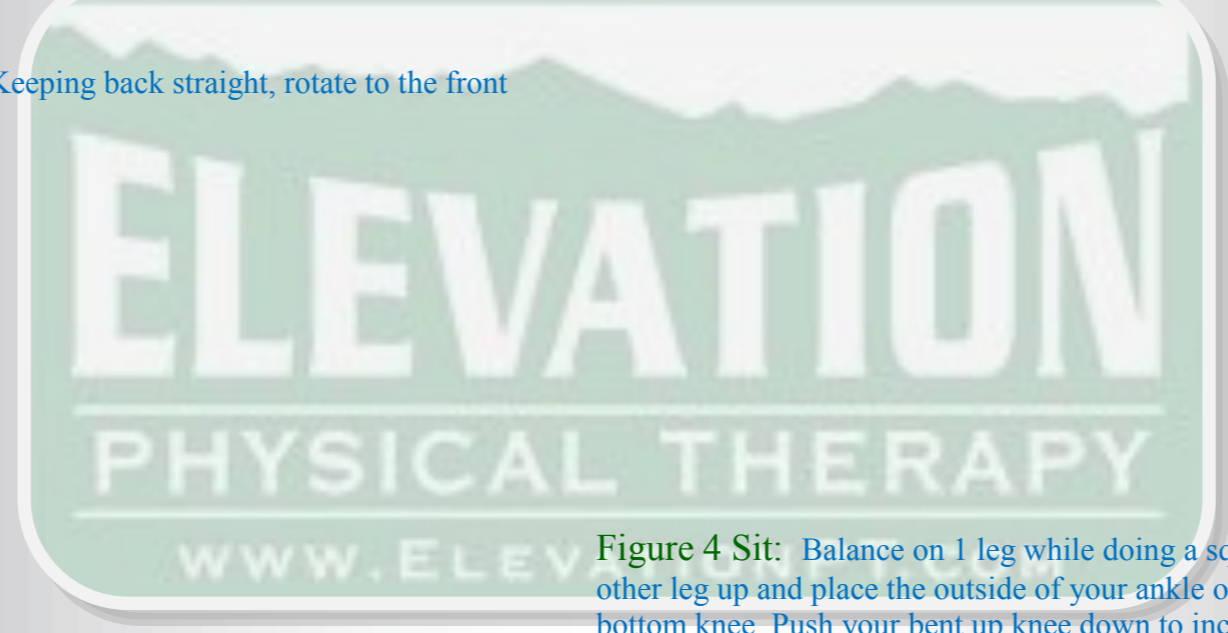
Figure 4 Sit: Balance on 1 leg while doing a squat. Bring your other leg up and place the outside of your ankle on the top of your bottom knee. Push your bent up knee down to increase the stretch.

Lunge Rotate: Keeping back straight, rotate to the front knee