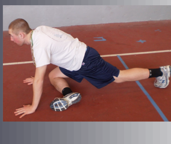
Figure 4 Lunge: Starting out on all fours, cross your 1 leg under your body, so that you are almost resting on your hip. Extend your opposite leg directly behind you. Lower your upper body over your front leg, placing your forearms on the ground in front of you. Swing your back leg through and walk your hands up to repeat on the other side.